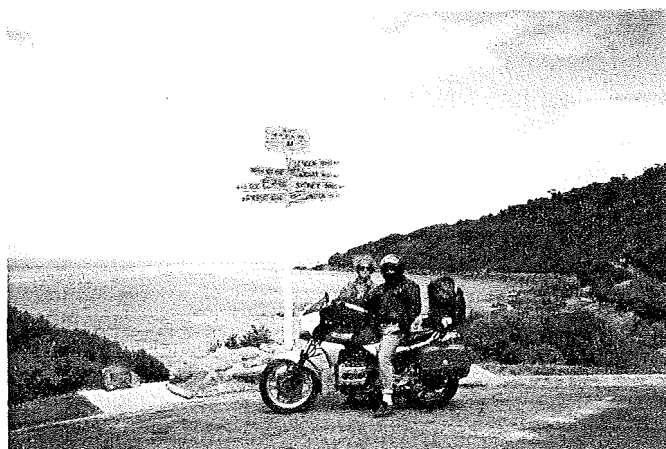
Victor & Francine Buck at Bluff NZ

We rode from Auckland to Cape Rienga, the top of the North Island, to Bluff, the bottom of the South Island, and crossed from the east to the west coast several times, finishing up at Auckland, having driven a total of 9,000 km. Highlights were Lake Taupo, Rotarua, the catamaran ferry from Wellington to Picton, the Canterbury Plain, beautiful coastlines and inland passes. We also enjoyed mountains and glaciers, Queensland, the fabulous fjords, Doubtful and Milford Sounds, the Bay of Islands, the site of the Treaty of Waitangi, rare, primeval Kauri forest, and the Banks Peninsula with the town of Akaroa, a town in which I would gladly settle.