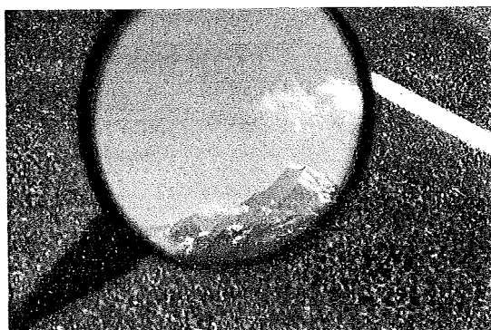
view of Mt Cook through Victor's rear mirror

As you may have heard, New Zealand is a motorcyclist's dream. Once out of the few larger cities, there are many winding narrow roads with little traffic, Magnificent ocean scenery, beautiful pastoral settings, populated with more sheep one would suppose ever existed. There are also snow-clad mountains with palm trees at the feet of the glaciers, and some of the friendliest people, many of whom are fellow motorcyclists.