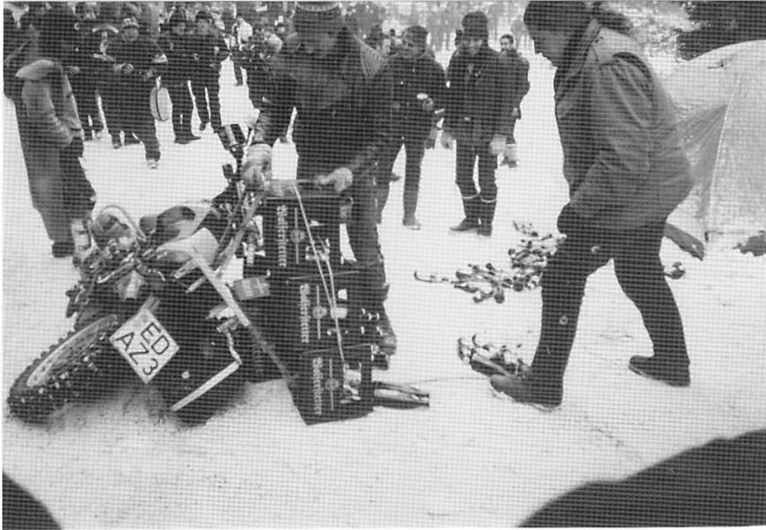
Only three bottles broke!

As I sat looking at the faces around our fire, my mind turned to the thousands upon thousands of men and women, of the generation ahead of mine, who couldn't be at the Elefant because of war.